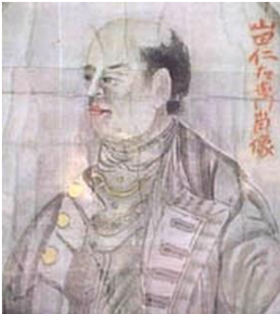
山田長政 Yamada Nagamasa

130 th Anniversary of Thailand-Japan Diplomatic Relations 2017