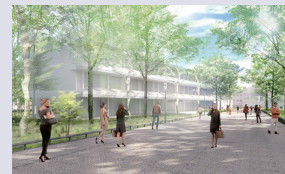
● A new "Komorebi no Michi" path and faculty building (currently in planning; the image is a conceptual rendering).

*As of April 2025, this is a proposed plan. The faculty name is tentative, and the details of the plan are subject to change.