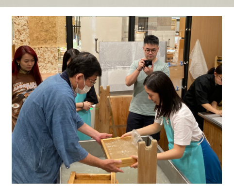
Participants visit a special workshop