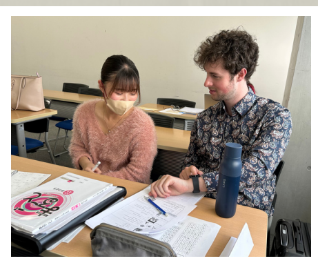
Interactive classes with Toyo students