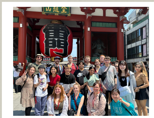
Toyo students join you on site visits

Japanese Language Classes Farewell Party