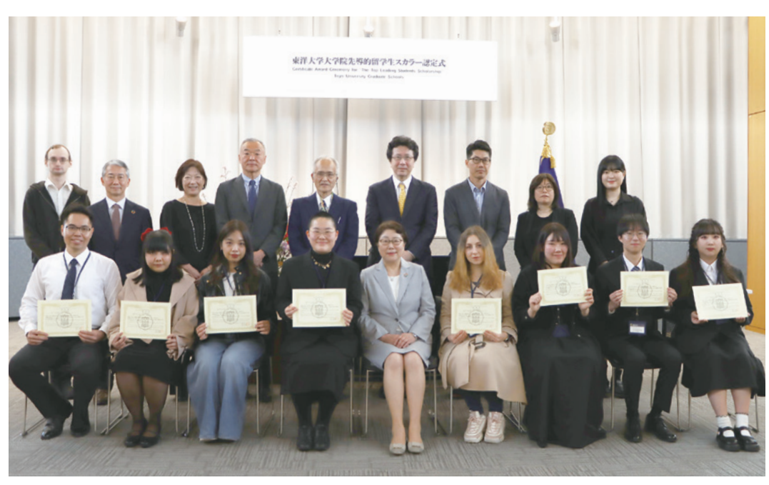
Toyo\ University\ Graduate\ Schools\ Leading\ international\ students\ Scholars\ for\ AY2025\ Accreditation\ Ceremony.