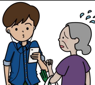
Do not use a smartphone while walking.