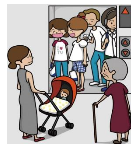
Use the stairs instead of the elevator.