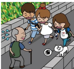
Do not walk two abreast.