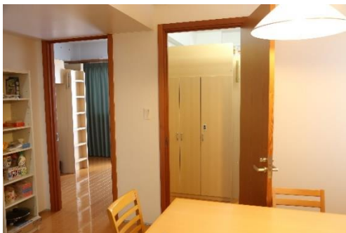
Single-occupancy bedroom(left) and Double-occupancy bedroom(right)