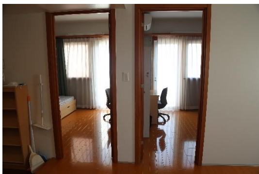
Two Single-occupancy bedrooms