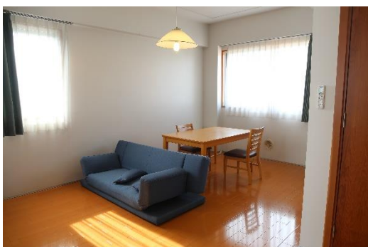
Shared living room