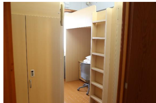
Double-occupancy bedroom (A loft type bed)