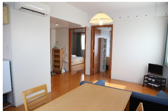
Shared living room