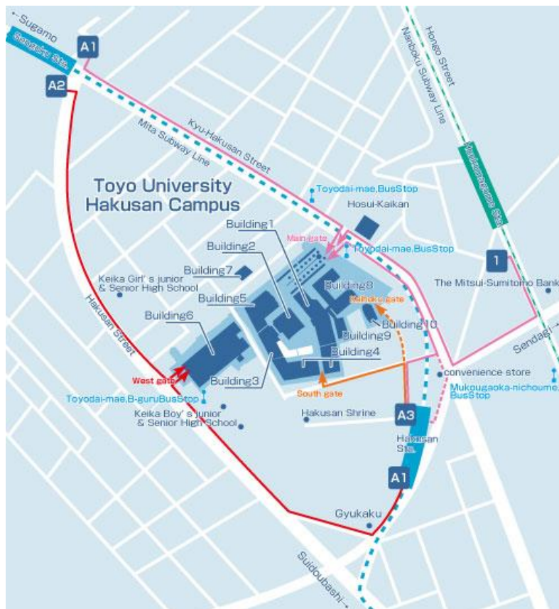
Toyo University Hakusan Campus

https://www.kitazono-j.co.jp/kitazono/ http://www.kitazono-j.co.jp/doc/kitazono_pamphlet_eng.pdf